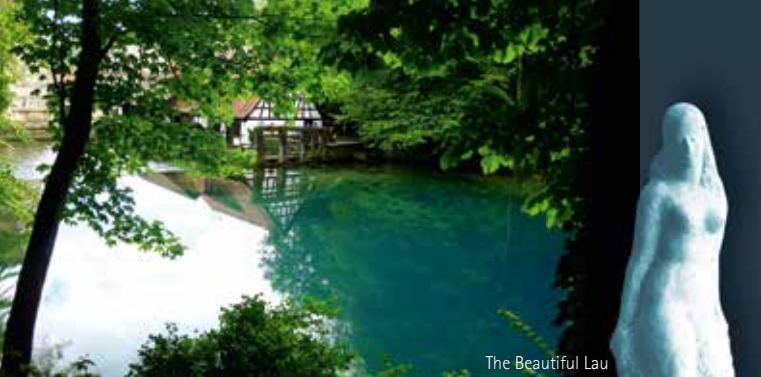
The Beautiful Lau