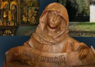
Sculpture of donor Adelheid