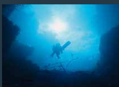
View from the bottom of the Blautopf to the surface

Next to the Blautopf there is a water-powered drop hammer mill, which was a working smithy from 1804 to 1889. In 1964 it was turned into a museum. It illustrates how in the old days iron was forged with the help of drop hammers.