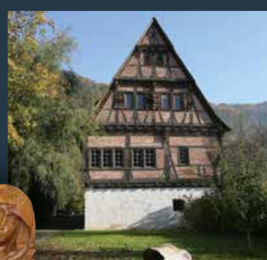
The Monks' Bathhouse