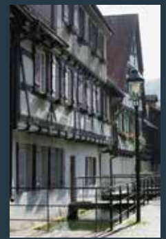
The tanners' quarter