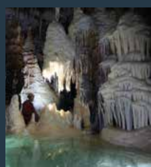
Cavern in the Blue Cave system