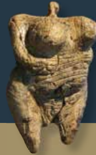
Venus from Hohle Fels

The exhibition familiarizes you with our cultural roots as it explains the giant cultural leap that Ice Age humans made when they began to create art. If you have an appetite for more details about Stone Age life and culture you can book a guided tour or take part in one of the workshops on offer.