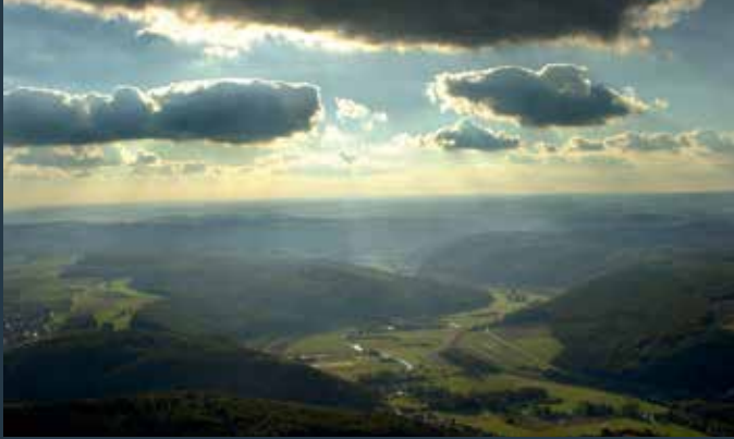
Valley of the river Blau