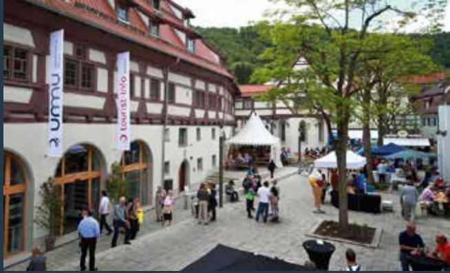
Former Spital, now Prehistoric Museum