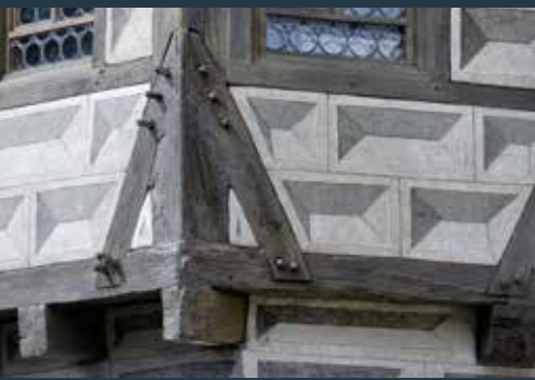
Imitation of hewn stones painted on the plastering of the Little Big House