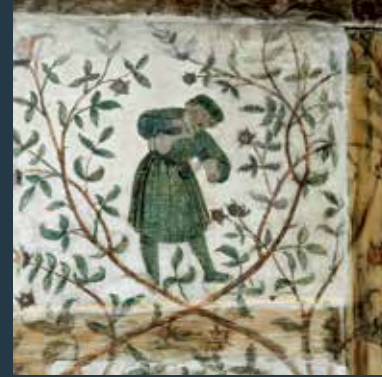
Wall frescoes in the Monks' Bathhouse